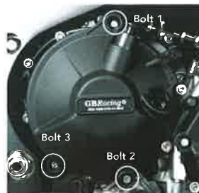
Bolt 3 M6x40HHF - 10Nm