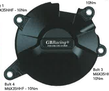
Bolt 2 M6X35HHF - 10Nm