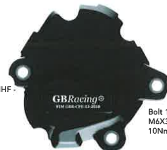
Bolt 1 M6X35HHF - 10Nm