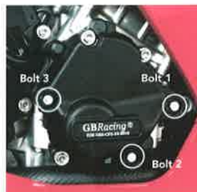
Bolt 3 M6X35HHF - 10Nm