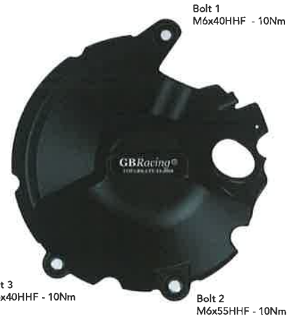
Bolt 1 M6x40HHF - 10Nm